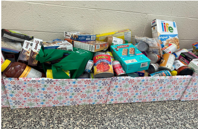
Thank you to our BCPS Families for supporting our Food Drive that provides food to local families.