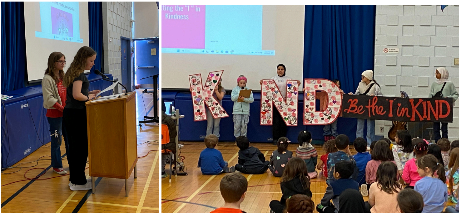
Our student led assembly where students shared their ideas about kindness and what it means to be an upstander