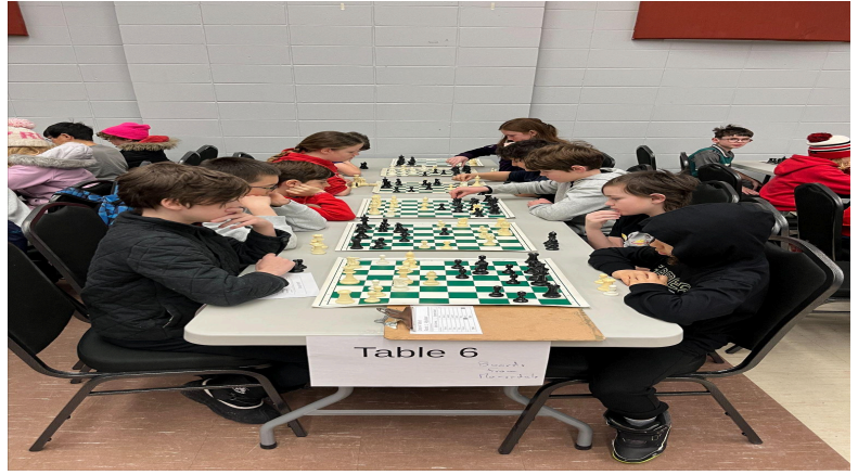
Students working on Math problems on vertical learning spaces and our chess team represented BCPS well at the District tournament