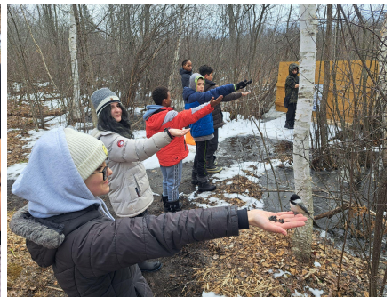
Grade 6 class explored Bill Mason Center and stood quietly to feed the birds.